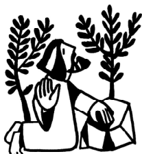
My father, if it is possible let this cup pass me by

1 st Maundy Thursday 7:30pm Eucharist of the Lord's Supper SINGLETON followed by Watch at altar of repose for 1 hour