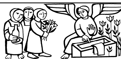
Alleluia Alleluia Alleluia

4 th EASTER DAY (1st Sunday) 8am Eucharist SINGLETON 10am Parish Eucharist EAST DEAN 6pm Eucharist WEST DEAN